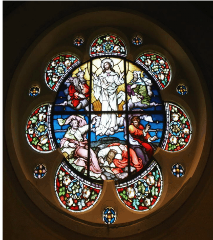
The Last Sunday After The Epiphany – The Transfiguration of Our Lord – 17 January 2016