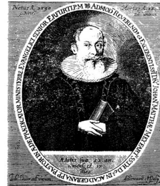
Johann Matthäus Meyfart Professor und Doktor der Theologie

1635 and in 1637 he married again. In 1633 he became professor of theology at the Lutheran university in Erfurt. He worked throughout the Thirty Years War. With the Peace of Prague in 1635 he lost his professorship and became a parish